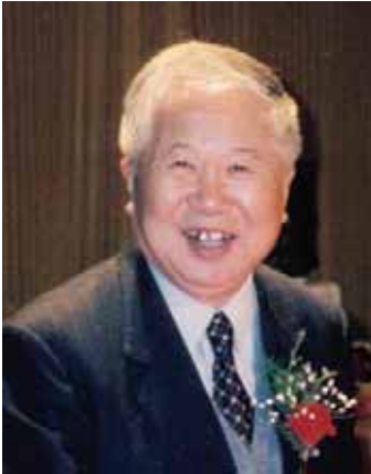
Wu Liangyong Professor of Tsinghua University Academician of Chinese Academy of Sciences Academician of Chinese Academy of Engineering

China's urbanization takes less than one hundred years to pass a road which is completed by industrial countries for two or three hundred years. But it is also facing all kinds of common problems existed in the urban and rural environment worldwide. The economic and social changes of China in the past 30 years are remarkable, including the transformation of planned economy to socialist market economy, great migration of rural population to cities and towns, and profound change of the mechanism for urban and rural development. In the process of accelerated urbanization, there are various problems that have occurred along with development.